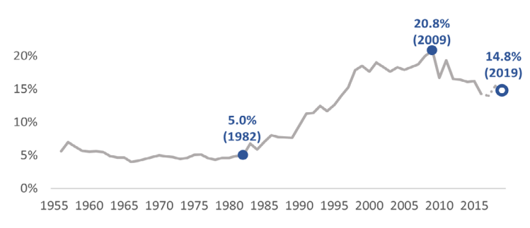
Figure 1: Small Business Share of R&D Performance

Note: 2017-2019 shares for businesses with 5-9 employees imputed by author.