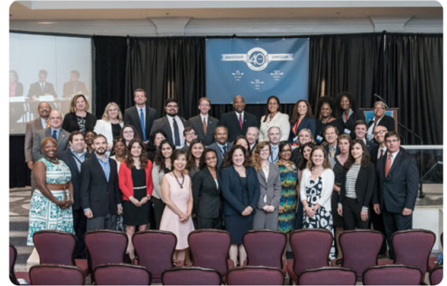
Advocacy staff in attendance at the 40th anniversary symposium in June 2016. The office's five teams handle administrative, economic, legal, regional, and public affairs.

This roundtable gave small business owners an opportunity to discuss IRS guidance on cafeteria plans. Small business stakeholders made presentations to Department