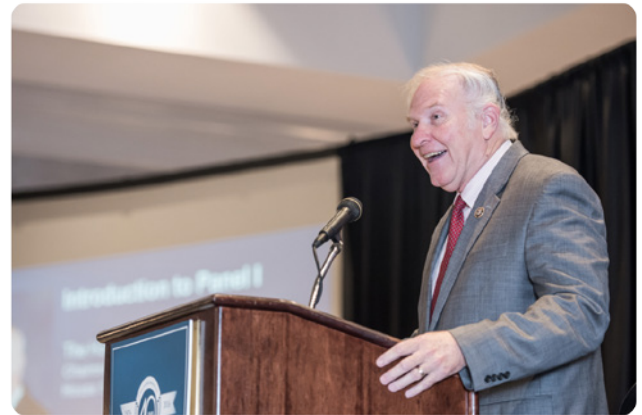
Representative Steve Chabot, chairman of the House Small Business Committee, speaks at the 40th anniversary symposium. The committee works toward legislative solutions to strengthen the RFA and the Office of Advocacy.

and educated agency officials on the best RFA compliance practices. In addition, E.O. 13272 required Advocacy to track agency compliance with these requirements and report on them annually to the White House Office of Management and Budget.