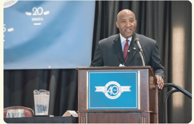
Darryl L. DePriest, the seventh chief counsel for advocacy, hosts the Office of Advocacy's 40th anniversary symposium in June 2016.

The ideas behind the RFA are common sense: (1) to consider all the alternatives when a proposed regulation will have a significant economic impact on small businesses; and (2) to let small businesses participate in shaping a rule, providing real-world perspective on how small businesses operate in different industries and regions. The execution of these ideas is more complicated, since the subject matter of a regulation is often technical and detailed. The Office of Advocacy's attorneys and economists spend untold hours reading, interpreting, and analyzing volumes of complex regulatory proposals.