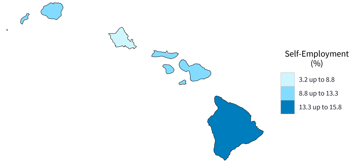
Figure 4: Hawaii Self-Employment Rates by County, 2017