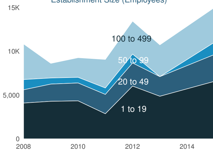
Figure 1: Northern Mariana Islands Employment by Establishment Size (Employees)