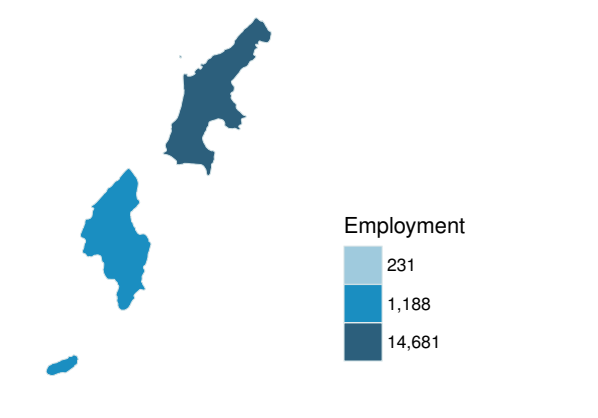
Figure 3: Northern Mariana Islands Employment by Municipality, 2015.