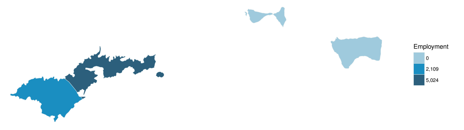
Figure 3: American Samoa Employment by Municipality, 2015.